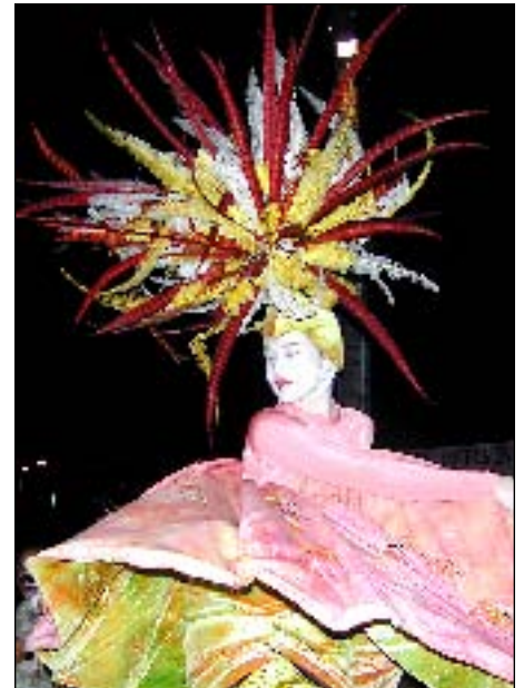
Geneva Rivera as Sea Anemone @ Waikiki Aquarium

gave us a different kind of connection with the audience in a more intimate setting.