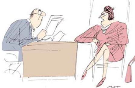
"As you can see, I plan to retire next week, and I haven't saved a dime. This is your chance to become a legend."